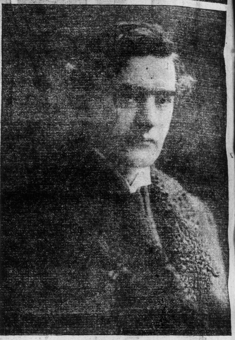
The eminent actor Tyron Power who will appear in the original role of "The Dragoon" in Charles Raim Kennedy's great morality play of "The Servant in the House," at the Grand Opera House on Thursday, March 18 under the management of the Trans-Canada Theatres Limited of Montreal