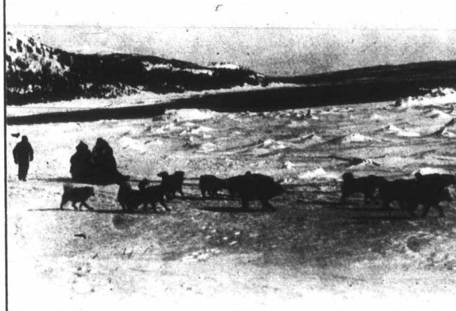
Travelling in Labrador.

which is not represented in the student body, and that there are a few from the more distant regions of Central Africa. One fact showing the genuine interest of the natives themselves in this college and also an illustration of the spirit of self-reliance which it develops, is that the native students last year paid in fees over $25,000. Other native institutions sent deputations to Lovedale to attend my meetings. Some tifty young men tramped over the mountain from Healdtown and remained until the close