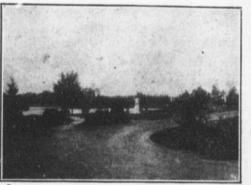
VICTORIA PARK, BERLIN.

'he expenses at the school will be seven dollars for the week for each member. Two dollars for registration fee and five