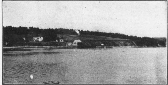
VIEW FROM THE MOUNTAIN, NEW CAMPBELLTON.

attending, and the regular evening service took the form of a platform meeting addressed by one of the visiting missionaries on some phase of the home or foreign mission work. The school will be held in the same