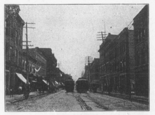
KING STREET, BERLIN.

cussed, and in the cities, in offices where