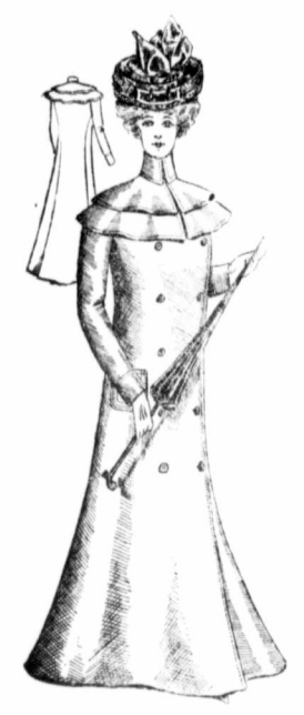
3719 Storm Coat.

for stormy weather. As illustrated the material is waterproof cloth and the cloak is adapted to damp days; but made from broadcloth and lined with wadded silk it becomes an entirely satisfactory sortie du bal, and made from covert cloth or other suitable material is again transformed into a stylish ulster or automobile coat.