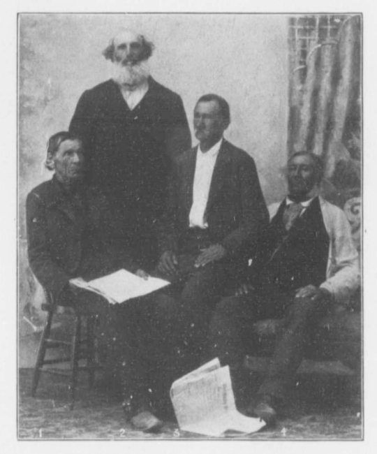
A GROUP OF VOYAGEURS.