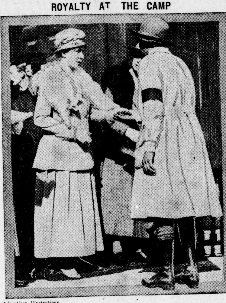
ROYALTY AT THE CAMP Princess Mary visits Cambridge to inspect the Cambridgeshire Women's Band Army Workers, and to distribute badges and stripes to them for their services. The ceremony took place at the Senate House. Princess Mary handing the service badges and stripes to the band workers.

London, May 9.—Four police raiding parties entered ten Turkish baths early this morning and arrested 75 young men who could not produce registration cards. Some of the bathers tried to hide in the steam and the detectives had an uncomfortable time locating them. The raids were made at the request of the federal authorities endeavoring to round up all military slackers.