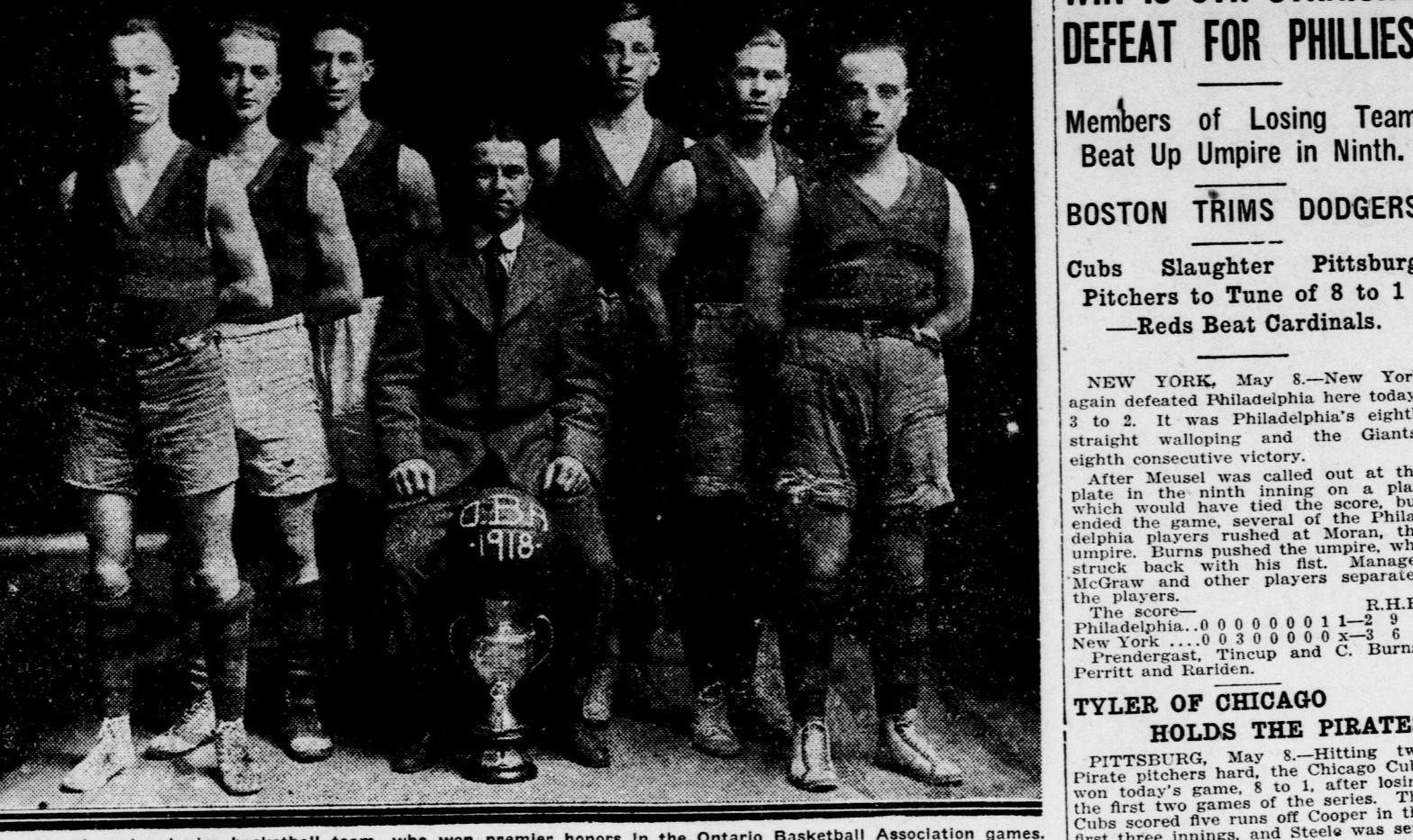
London champion junior basketball team, who won premier honors in the Ontario Basketball Association games.

HUSKY BASKETBALL SEXTET WHO CAPTURED JUNIOR CHAMPIONSHIP TROPHY