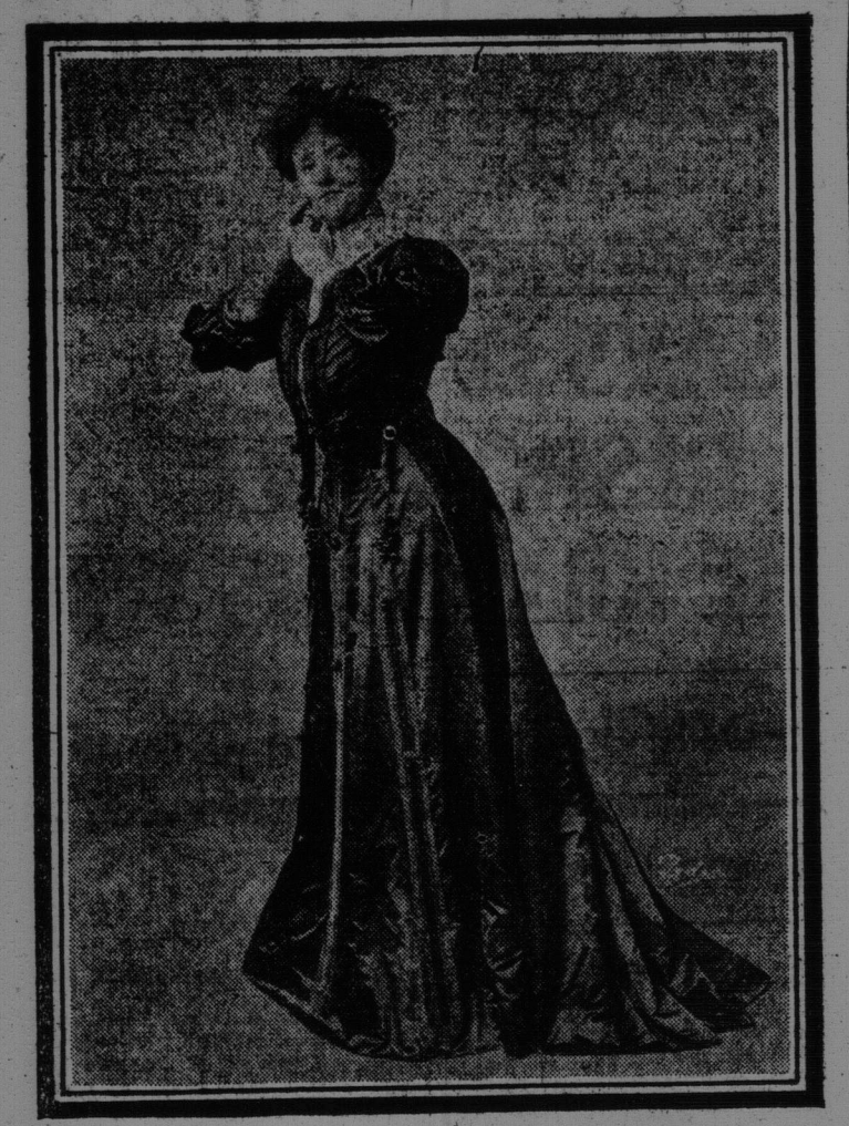
REGAL GOWN OF BROWN SATIS

costume distinctive for its beauty of de as well as material is this creation rich brown satin. The trimming is rar unusual, being strappings of brown vet over wider straps of cloth, the vet outlined with two rows of brown gold. Soutache. The dress is a one-piece mod with bodice suggesting Eton lines in the long heavily tasseled points back as front, and the loose fronts which tie with heavy silk cords over a vest of pale block as vet outlined with two rows of brown gold.