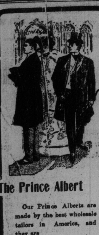
The Prince Albert

THREE MONTHS FOR PERATOR. Magistrate at South St. Marie imposed $100 fine.