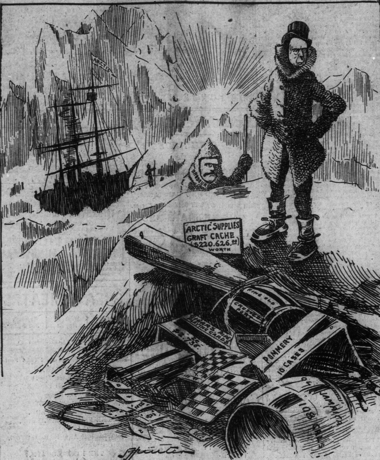
CAPTAIN LAURIER (gazing upon wreck of Cache): Alas! more of the devilish work of Tory polar bears.