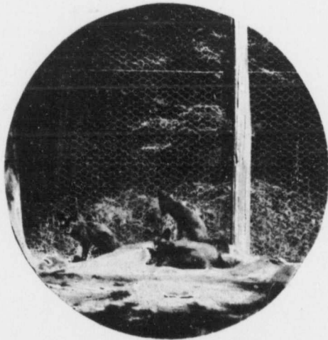
PART OF A LITTER OF SIX PUPS

Even the offspring of several generations of foxes reared in captivity remain wild, and, except when young, evince more or less distrust of human beings. Still, life in the wire enclosures does not seem unpleasant to them. When thinking themselves unobserved, they play together or lie contentedly stretched at length in the sun. Cold weather has no terrors for them, and snow is a delight.