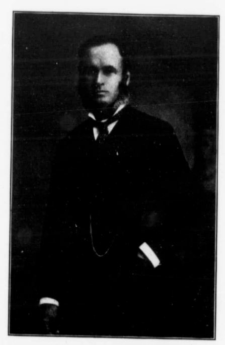
HON. T. B. PARDEE Commissioner of Crown Lands