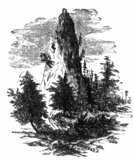
Sugar Loaf Rock.*

Taking the road which leads into the interior of the island, we soon find ourselves at the "Sugar Loaf Rock." This rock is about one hundred and fifty yards from the foot of the high ridge, upon the south-east extremity of which stands Fort Holmes. The plateau upon which it stands is about one hundred and fifty feet above the level of the lake, while the summit of the rock is two hundred and eighty-four feet above the lake, giving an elevation of 134 feet to the rock itself. The composition of this rock is the same as that of Arch Rock. Its shape is conical, and from its crevices grow a few vines and