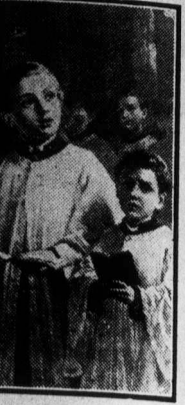
CHURCH.—The will render the follow- s at the 8 o'clock Mass day.