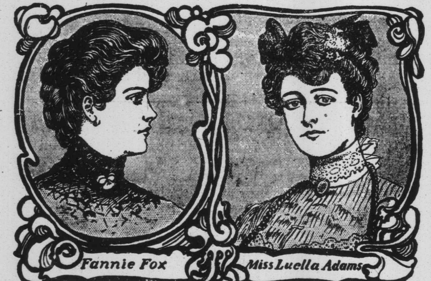
One of the greatest triumphs of Lydia E. Pinkham's Vegetable Compound is the conquering of woman's dread enemy, Tumor.