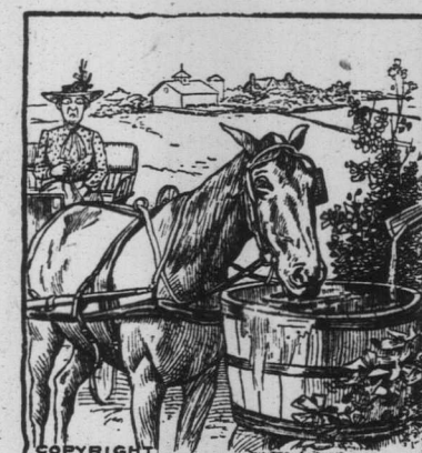
Driven to Drink

Campbellton office 1st to 27th Dalhousie 27th and 28th New Mills 29th Bathurst 30th and 31st Each month Local Anesthetic, Laughing Gas, Chloroform or Ether administered for the painless extraction of teeth.