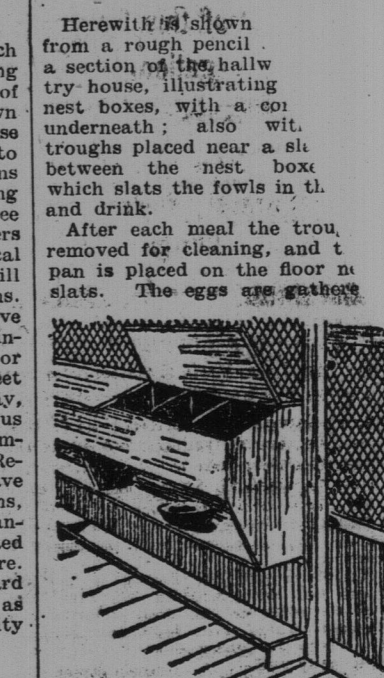
POULTRY HOUSE HALLWAY. The hallway, and there is no need to go into the coups except to clean the droppings board, renew the litter, etc.