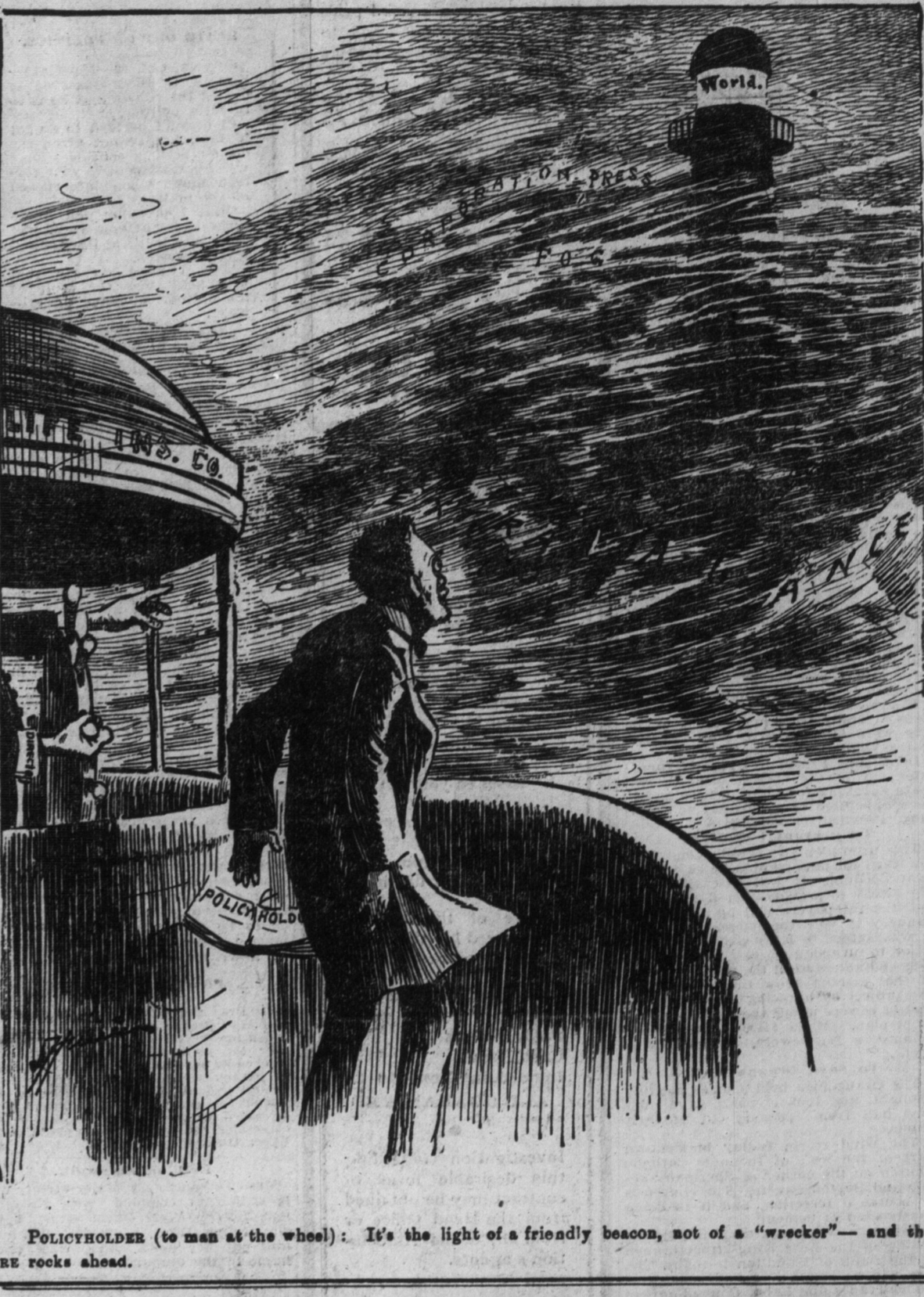
POLYHOLDER (to man at the wheel): It's the light of a friendly beacon, not of a "wrecker"—and there are rocks ahead.