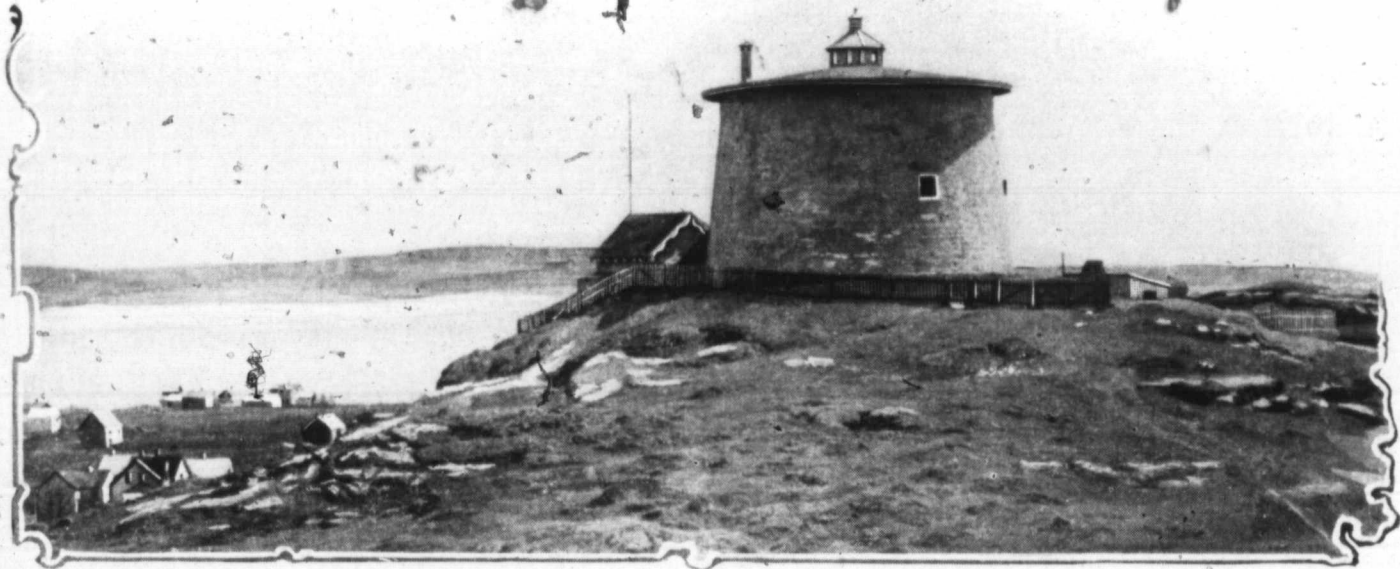
MARTELLO TOWER, ST. JOHN, NEW BRUNSWICK.