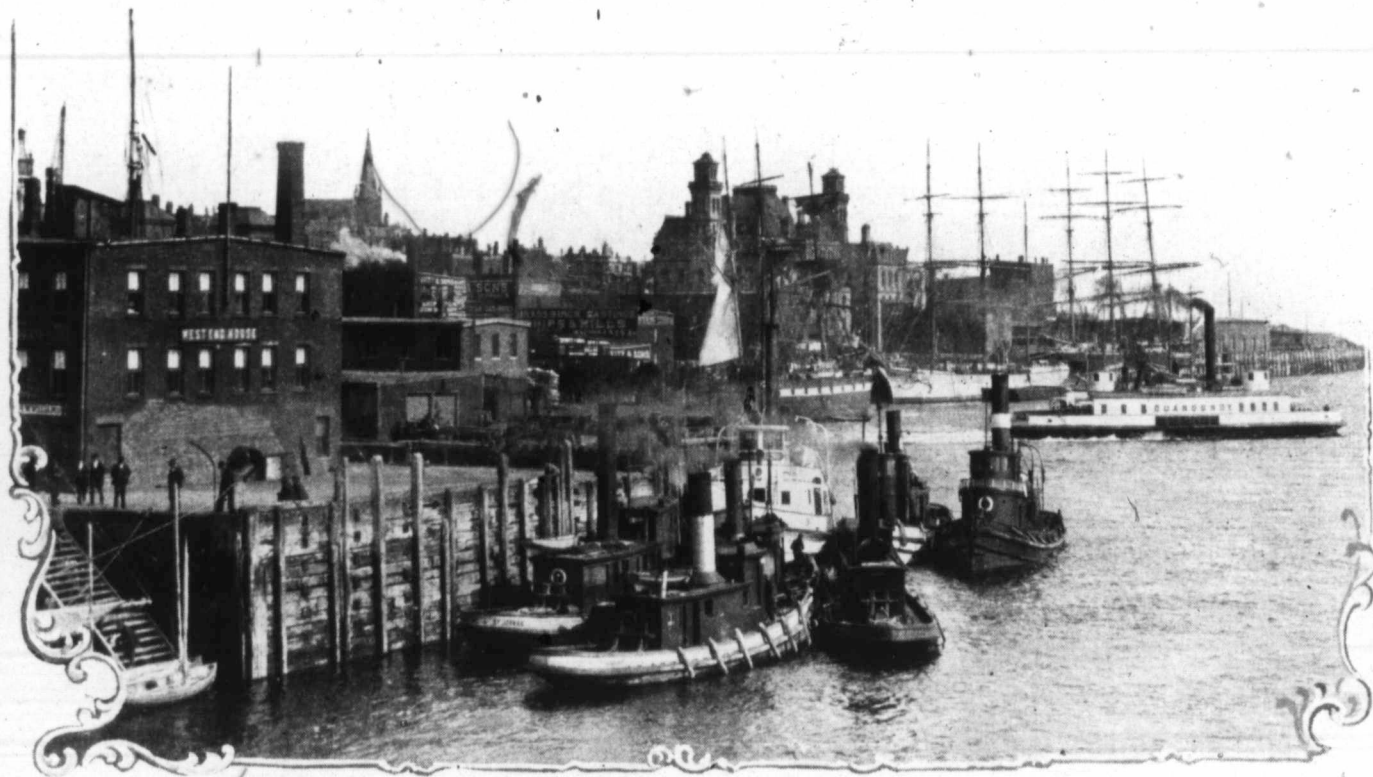
HARBOR SCENE, ST. JOHN, NEW BRUNSWICK.