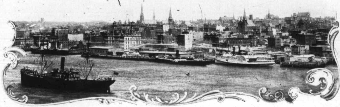
ST. JOHN, NEW BRUNSWICK.