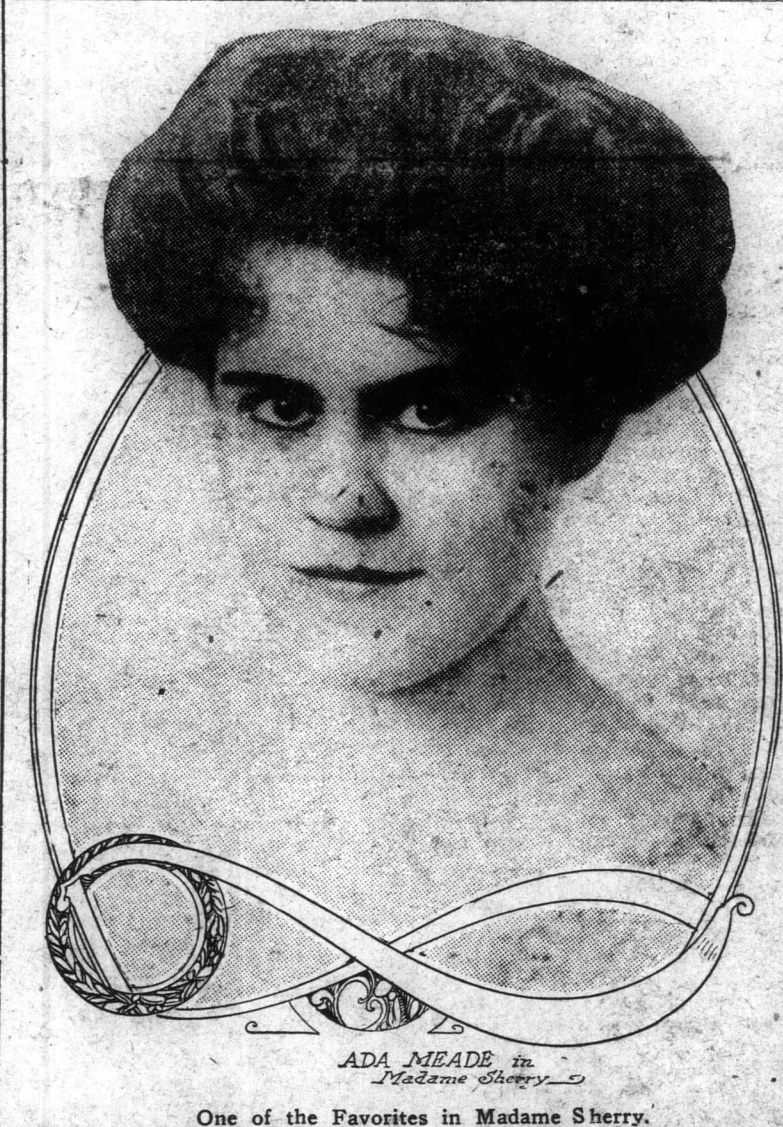
One of the Favorites in Madame Sherry.

Crowds in the Galleries. The night was full of incident, in anticipation of which throngs of sightseers had found their way to Parliament Hill and packed the galleries of the House. The debate had dragged itself through the afternoon, and had been dying for an hour after