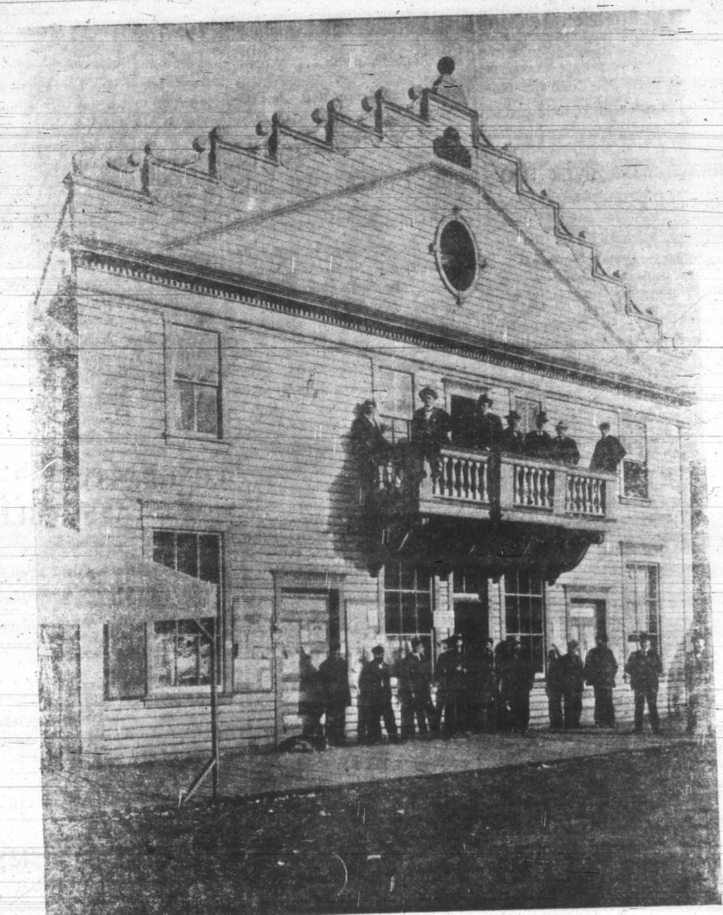
OLD POST OFFICE BUILDING, DAWSON.