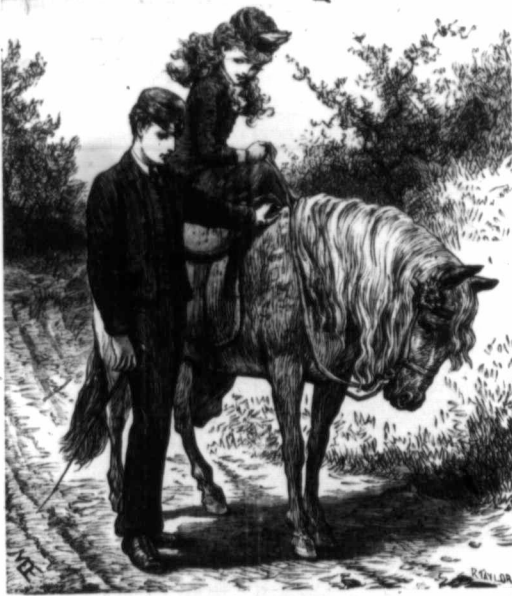
THE KIND REBUKE.