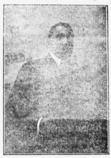
GEN SOULOUQUE EMPEROR OF HAYTI.

and in the finest state of cultivation; men who are in every way model and respected citizens. What makes this particularly worthy of note is the fact that by far the greater part of these are men who had escaped from slavery by the underground rail-