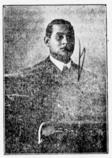
GEN. DESOLINS, EMPEROR OF HAYT!

always thought that my mother and father were of the same opinion, but they never said so to me, but when I would go to the house after my day's work was done and tell them what I had done they would say that is a good boy, still with that little bit I knew that they both thought well of me, so I