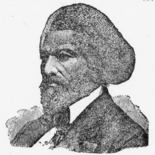
HON. FRDRICK DOUGLAS

fortunately existed through the different ages of man. I have read ancient history considerably during my life, and I find that the miseries inflicted upon mankind through war are mostly attributable to the morbid ambitions of men, such as Scipio, the Roman general, Sesosters, one of the ancient Egyp-