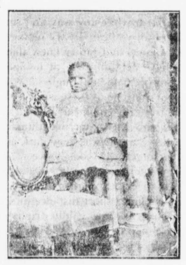
MY LITTLE DAUGHTER

mother and sisters would always be glad to see me, and of course I was glad to see them. They would always prepare dinner for me, after which I would take a walk with my sisters; on my return a talk with my father and mother, who would ask me how