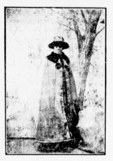
MY LITTLE DAUGHTER

beast, because the Indians were there in great force. They had a large camp near our place for a long time, and they would have their war dance at certain times and it would be a great sight indeed to hear those savage people yell and dance with the