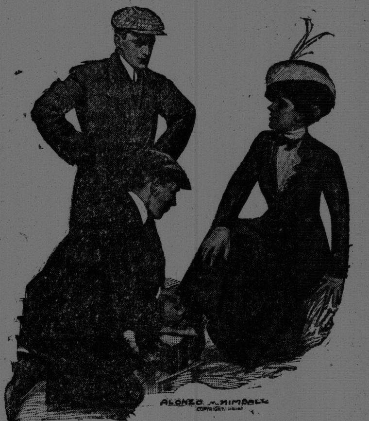
"Getting Colder"—Old Probe Says

Big days and big doings at the Semi-ready store for next fortnight 300 Suits and Overcoats away below wholesale cost of tailoring—Absolute reductions on every garment in the store for 10 days