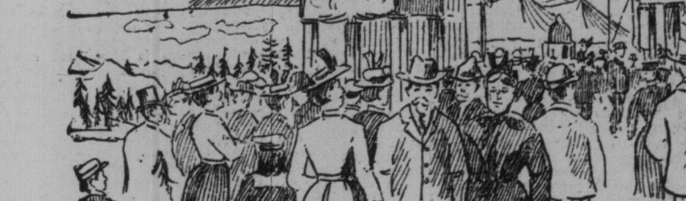
GLIMPSE AT THE MIDWAY AT THE FAIR.

Manufacturers Day at the Exhibition. Public School Board, City Hall, 7:45 p.m. Annual meeting Dominion Millers' Association, Board of Trade, 2 p.m. Concentrating of altar stones, St. Michael's Cathedral. Canadian Socialist League Convention, first day, 8 p.m. Canadian Master Bakers' Convention, Temple Building, 8 a.m. Banquet at McKenney's, 8 p.m. Grand "Le Voyage en Suisse," 8 p.m. Toronto, "The Funny Page," 2 and 8 p.m. Star, City Sports Bureaus, 2 and 8 p.m. Sixty Park, vandeville, 2 and 8 p.m. Hainan's Point, vandeville, 2 and 8 p.m.