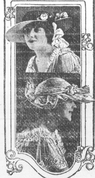
TWO DAINTY HATS.

This Season's Girl Will Wear Flimsy and Perishable Creations. "Trifles light as air," the new hats of the summer girl might be designated. Very pretty and becoming, they are trimmed gayly with fruits and roses and other flowers. The ones shown