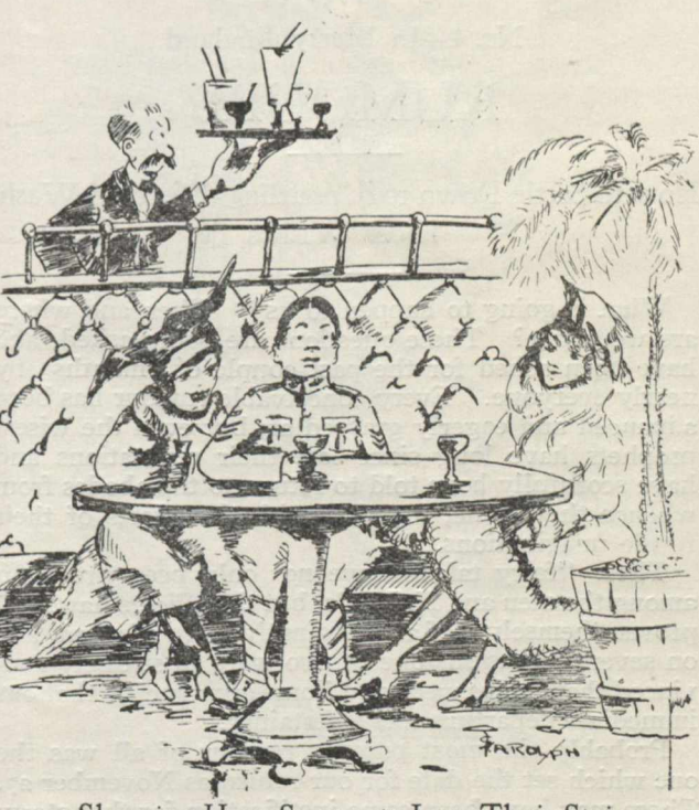
Showing How Sergeants Lose Their Stripes