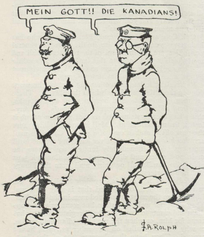
Our Comrades in Labor

There was a time when this song was sung just to pass the time away. Now it's the battle-cry of those alleged tank-drivers and gunners whose duty it is to complete the Wool-to-Bagdad Railway. Back in those unhappy days of war and trouble we hated the Hun-