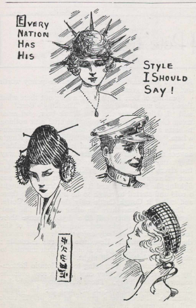
No. 3-In Bonnie Scotland; or Anywhere

books to read; in fact, if anyone had suggested three months ago that we would be living the life of ease and luxury that we are at present we would have politely informed him that he was insane.