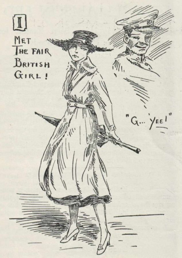
No. 1-In Merry England