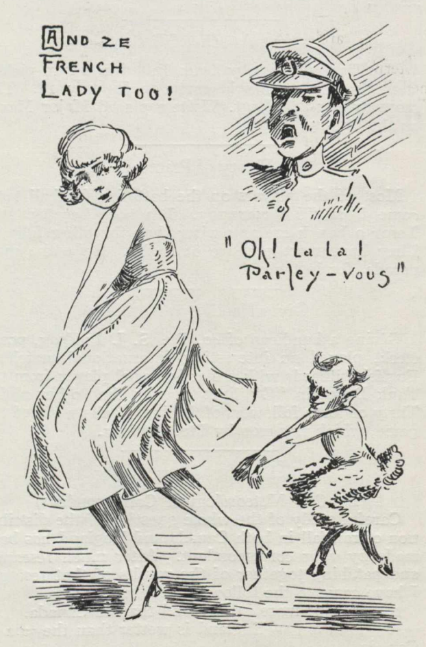
No. 2—In La Belle France

If the truth were known that undoubtedly is, and up to date has been, the situation. No one knows exactly where or when we are going and they probably won't know for some time to come. Looking at it from an absolutely impartial, common-sense viewpoint there really should be nothing of a very disturbing nature about that situation. At the time the armistice was signed we were the next tank battalion in line to proceed overseas, so until peace negotiations are over it is only natural that we will be kept in reserve; so why worry? Here we are in one of the most comfortable camps in England, warm, well-fed and clothed, granted the odd leave when finances permit, opportunity to indulge in any or all kinds of sports, plenty of good