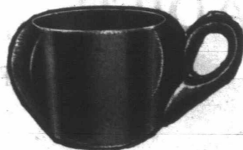
VENOMEDÉ CUSTARD CUP.

The Latest Parisian, London and New York Styles.