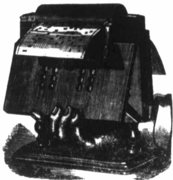
THIS SIZE $6.00

This engraving represents the instrument, and the mode of playing it requires no skill or musical knowledge, and even a child may play the most difficult piece.