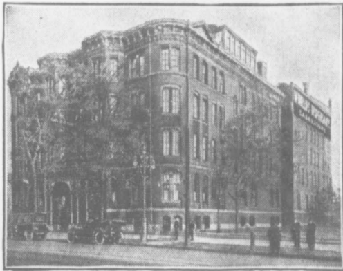
Invalids' Hotel and Surgical Institute in the heart of Buffalo, N.Y.

The several departments, consisting of the general medical, surgical (three operating rooms), diseases of women, a department for the treatment of ear, nose and throat, and a department for diseases of the urinary organs; each department fully equipped with modern appliances, with experienced nurses in attendance under the supervision of the medical staff; the laboratory for chemical and microscopical examination of urine, blood, sputum, stomach contents, etc., under the care of an experienced chemist, who devotes his entire time to this line of work. The electrical and general treatment room, with mechanical vibratory stimulation which improves nutrition, produces relaxation in the nervous and high strung, has a decidedly beneficial effect in cases of lumbago, sciatica, rheumatism in general of chronic type, sleeplessness, constipation and many other chronic ailments. Turkish and Russian baths, chemical baths, the electrical incandescent light bath. The X-ray, Ultra-violet ray, Sinusoidal and High-frequency, also Static, Galvanic and Faradic Electrical Currents are used according to the individual requirements.