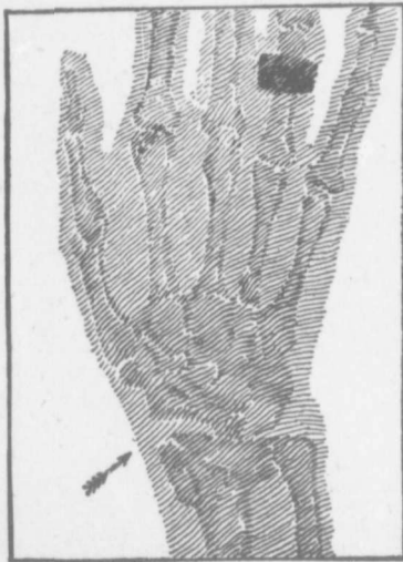
X-Ray Photo Showing Broken Wrist

Many thousand grateful patients have stopped at Dr. Pierce's Invalids' Hotel and Surgical Institute in Buffalo, N. Y., (see photo reproduction page 33).