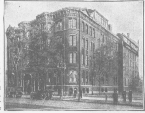
Invalids' Hotel and Surgical Institute in the heart of Buffalo, N.Y.

atory for chemical and microscopical examination of urine, blood, sputum, stomach contents, etc., under the care of an experienced chemist, who devotes his entire time to this line of work. The electrical and general treatment room, with mechanical vibratory stimulation which improves nutrition, produces relaxation in the nervous and high strung, has a decidedly beneficial effect in cases of lumbago. sciatica, rheumatism in general of chronic type, sleeplessness, constipation and many other chronic ailments. Turkish and Russian baths, chemical baths, the electrical incandescent light bath. The X-ray. Ultra-violet ray, Sinusoidal and High-frequency, also Static, Galvanic and Faradic Electrical Currents are used according to the individual requirements.