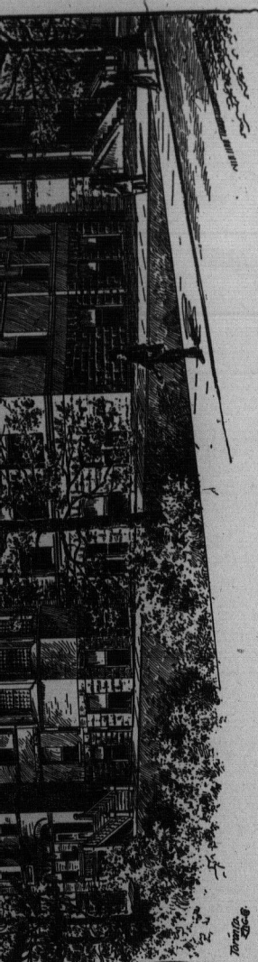
WYCLIFFE COLLEGE FROM THE NORTH-EAST.