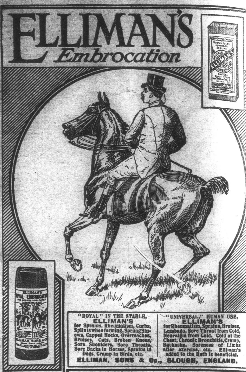
To be Obtained at all Druggists Throughout Canada.

The famous gardens of Versailles have nel and is reported to be the Leyland fire started in the boiler room of the liner Oxonian.