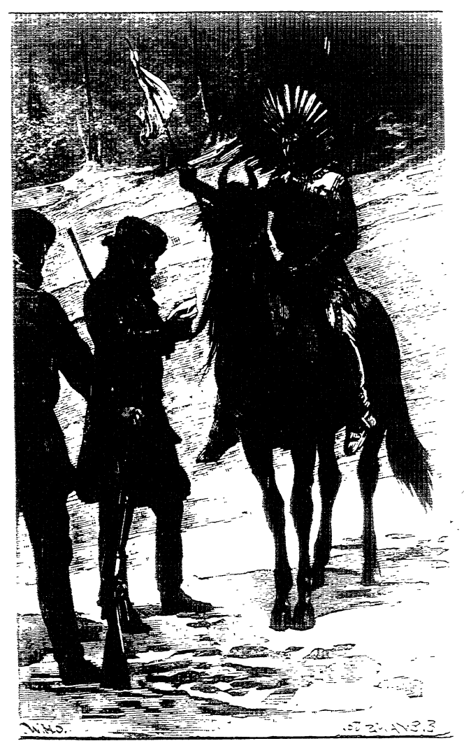
ADCENTING DIG DELINIC LETTER.