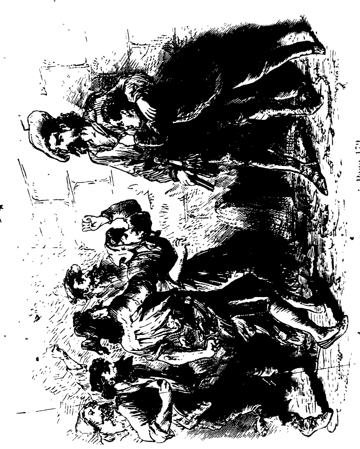
Тив Мов ат Sorres10. Раде 179.