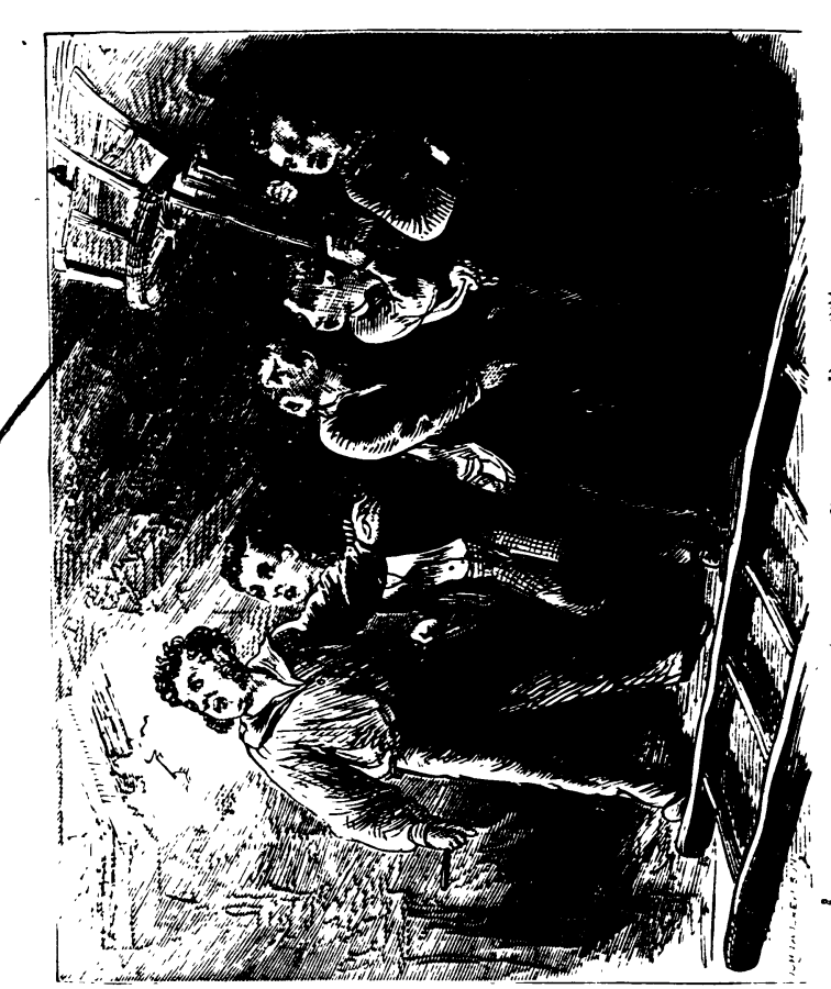
THE LAST OF THE BRIGANDS. Page 264.