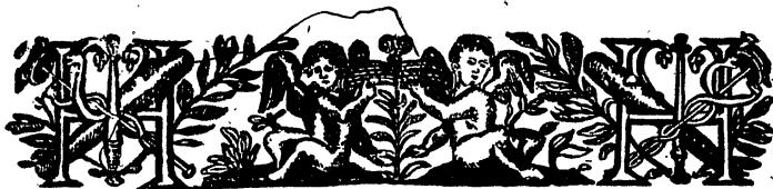
ILLUSTRATION TO VOL. VIII