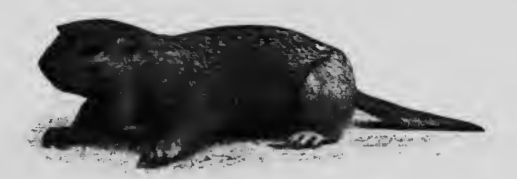
The common Gopher of Western Cauada,