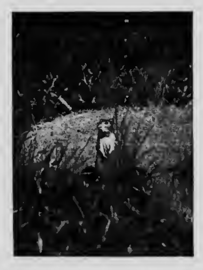
Characteristic attitude of the gopher.