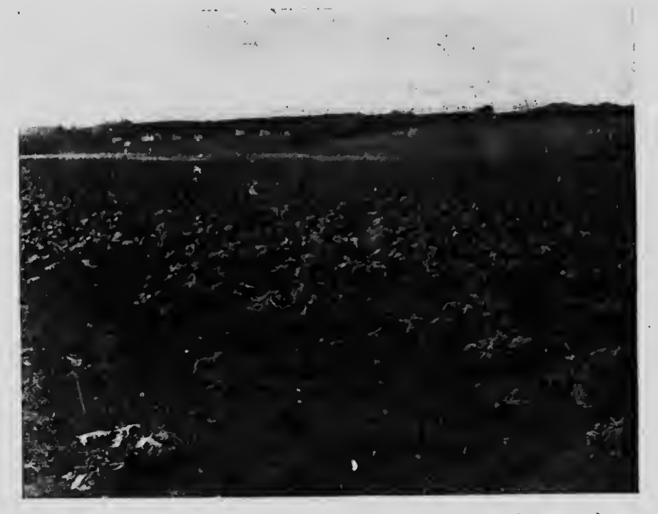
Mangel Field showing destruction of crop around a Gopher Hole; Gopher in foreground.

The Mole or Pocket Gopher.—Moreover, in the case of the mole or pocket gepher, trapping seems to be the best method of control. Since its burrows are entirely underneath the surface, and since the point in the runway at which he comes to the surface to deposit the earth excavated in the construction of the runway is closed with earth, there are no openings in the runway through which to introduce the poison readily. His habits of life thus render him comparatively safe from the poisoning method described above, and compel the adoption of trapping as the means of control or extermination. The pocket gopher digs a large number of runways which converge at