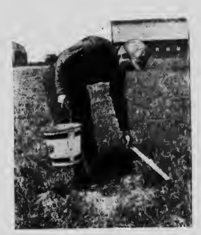
Placing poison in the gopher holes.