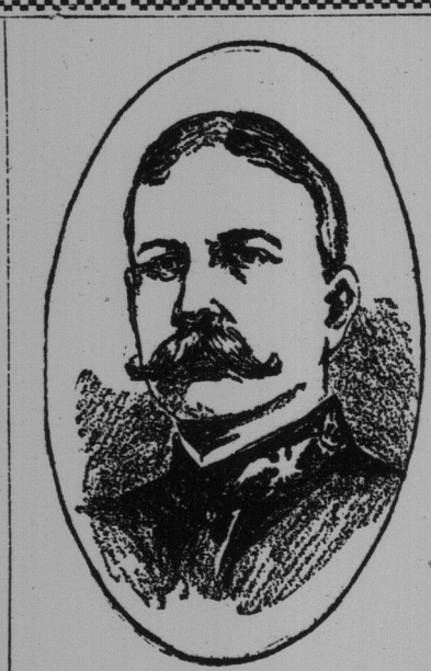
REAR ADMIRAL FRANCIS TRAIN

As for subjects remaining to be discussed, a tedious one, it is believed, and one which Russia will be disposed to negotiate with the greatest caution. is the programme for the restoration of Manchuria to Chinese control. Be cause of the confusion and general dis-brder likely to ensue in the province after the withdrawal of the foreign armies, Japan believes that a certain time will be required in which to restore public order and to establish a regular system of Chinese police administration. During the period Japan will insist that she remain in control