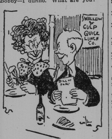
NOT OF THE EARTH. "You said that no earthly power should reparate you from that girl, and yet her father made her give you up."