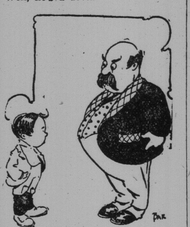
Papa-What were you and your ter quarreling about? Bobby-We wasn't quarreling; we