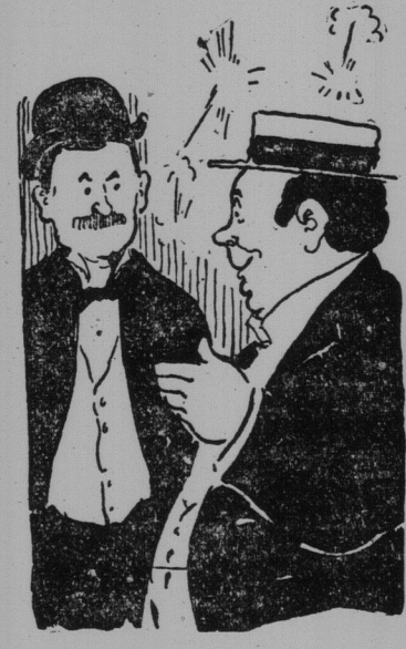
ALL KINDS OF BLOWUPS. Visitor-Having a good and pleasant

Domestic Ports. HALIFAX, July 26-Cld, barks Alastor, for Swansea; Hugo, for do; brig-Elsie, for Ship Harbor, NB. Ard, strs Angola, from Montreal