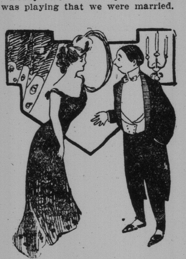
"No, I inherit a strong constitution."