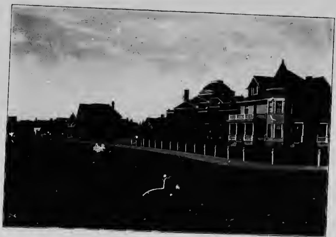
VIEW IN RESIDENTIAL SECTION 28