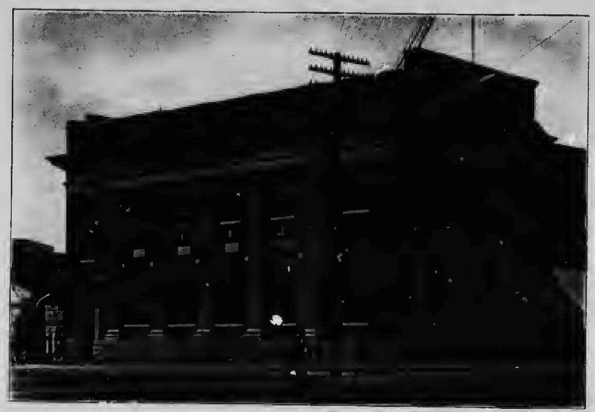
CANADIAN BANK OF COMMERCE