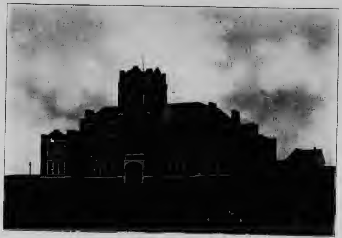
COLLEGIATE INSTITUTE 16