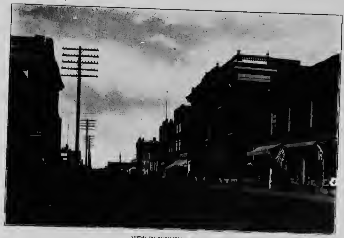
VIEW IN BUSINESS SECTION