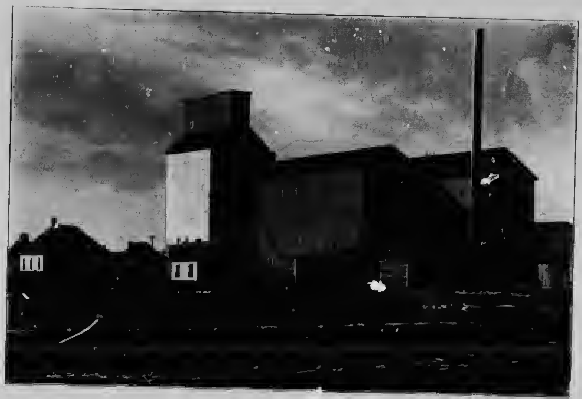
SHAWINIGAN FLOUR MILLS 10