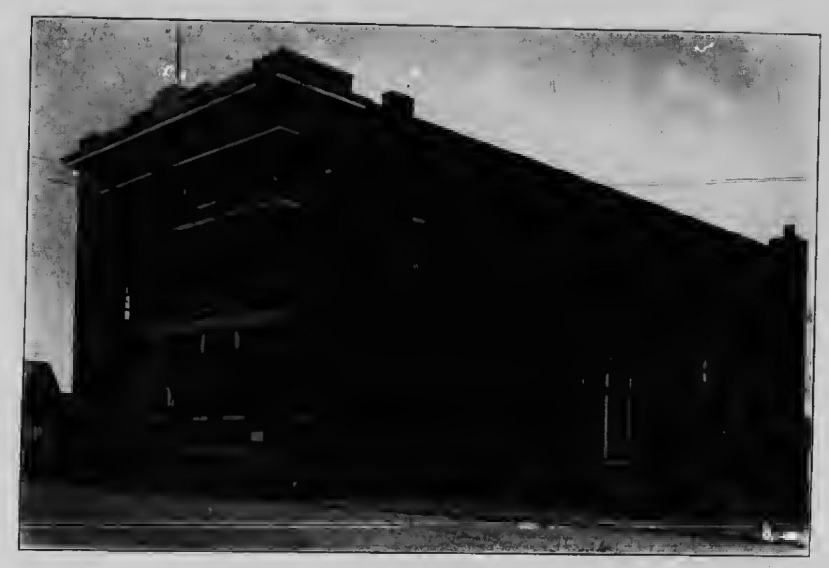
Y. M. C. A. BUILDING