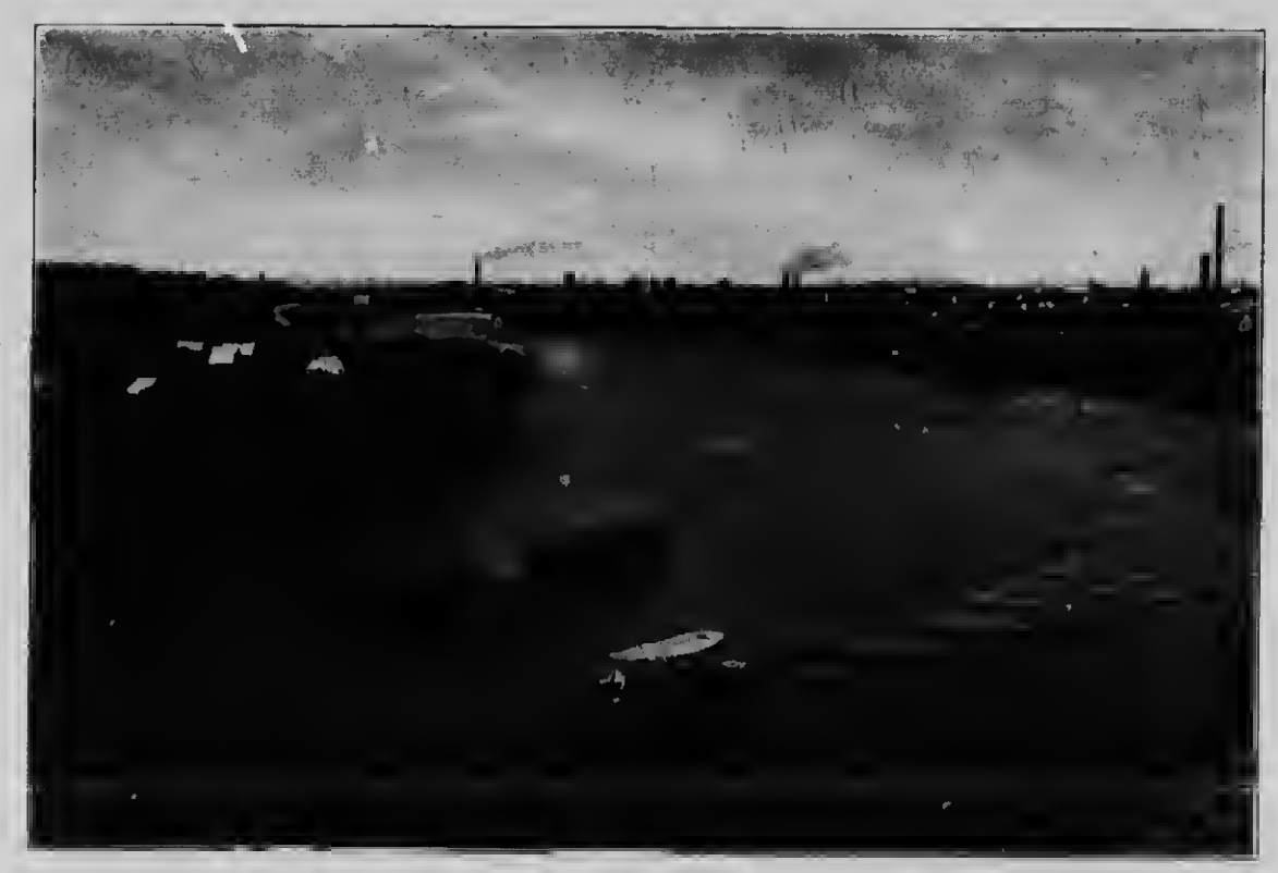
MOOSE JAW RIVER