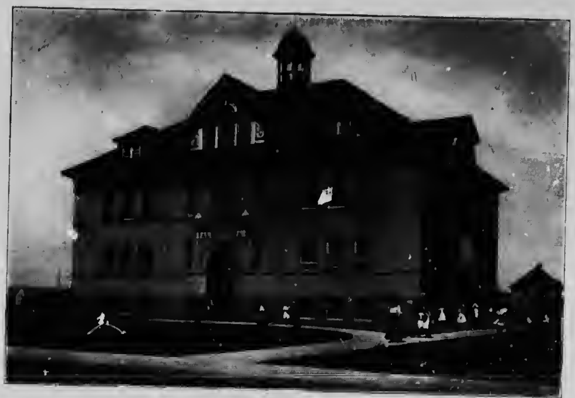
ALEXANDRA SCHOOL 18