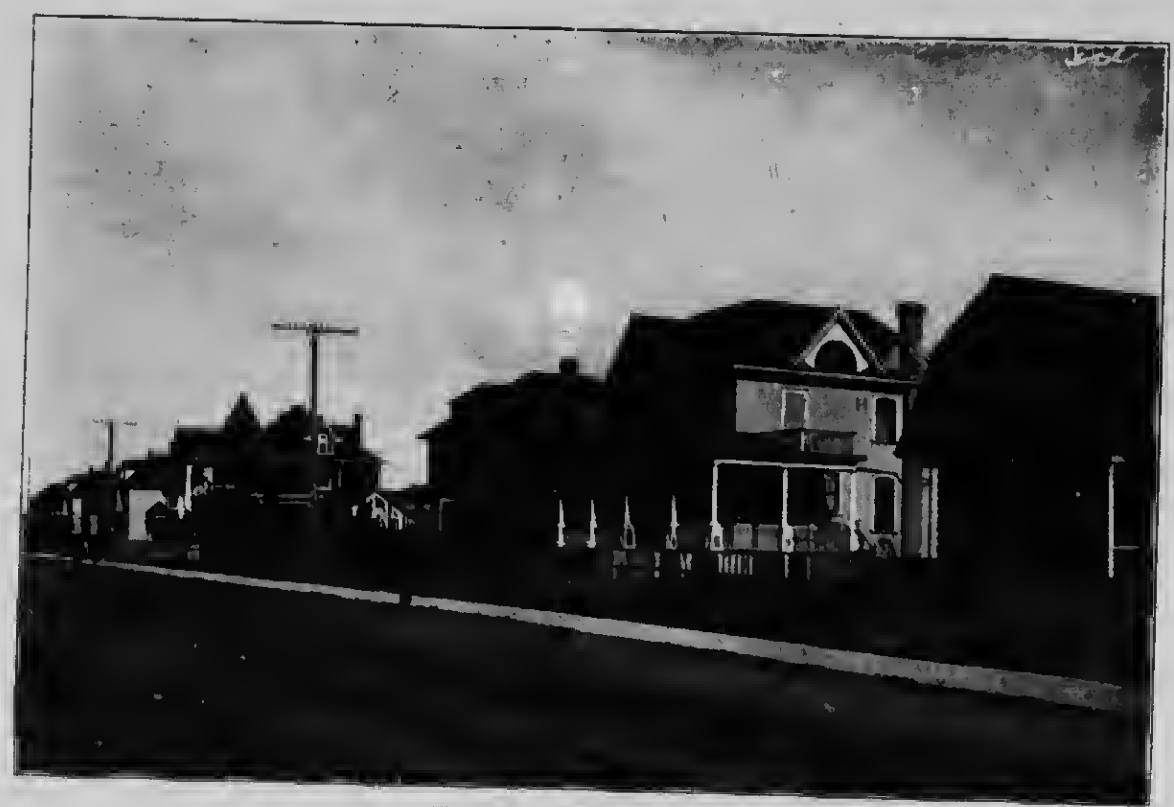
VIEW IN RESIDENTIAL SECTION