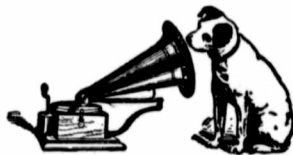
"HIS MASTER'S VOICE" BERLINER-GRAMOPH.

Write to us today for complete catalogues of the Victor Gram-o-phone and Victor-Victrola, and of 3000 Victor Records.