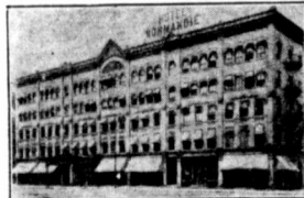
REAR VIEW HOTEL, MICH.

American Plan, $2.50 per Day and upwards.