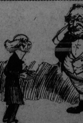
SIR WILFRID—NOTHING TO IT MR. BULL, JUST FIELDING AND PATERSON TAKING A TARIFF JOY RIDE.

London, June 12.—It is asserted here and also reported from Brussels that the international shipping strike will commence this week, but similar announcements have been so often made before that ship owners are skeptical.