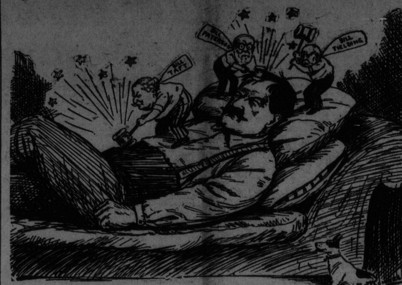
JOHN CANUCK—"Gee; that reciprocity makes me sick."