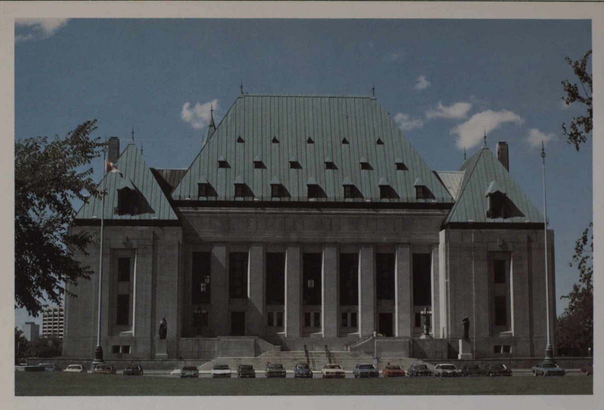
The Supreme Court in Ottawa