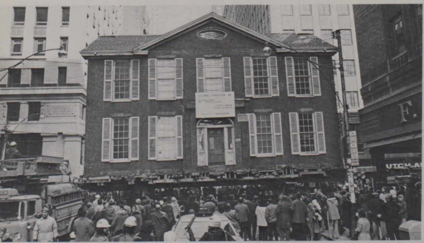
In 1972 Campbell House, the third oldest structure in Toronto, was moved by the Advocates' Society 5,305 feet from Adelaide Street East to Queen Street and University Avenue.