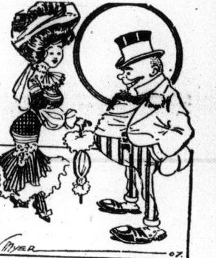
Wife—Where have you been all this time? Busy Husband—Hic—on a trip, my dear. Wife—Well, you evidently didn't go by water.

3, 4, 6, 15, 29, 31, 36, 39, 2, 47 and 52 Montreal—About 150 head of butchers' cattle, 70 calves, 178 sheep and lambs, and 156 fat hogs were offered for sale at the Point St. Charles Stock Yards this afternoon.