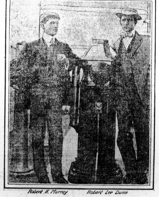
WITH TAFT AND PARTY IN THE PHILIPPINES.