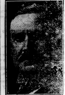
SIR THOMAS WHITE, Minister of Finance under whose direction the great Victory Loan drive for $500,000,000 in loans has been made.

On the opening of Canada's great Victory Loan drive the Minister of Finance issued the following message:—