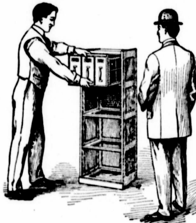
PUTTING IN FIRST INTERIOR