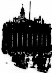
Head Office: Royal Exchange, London

Correspondence invited from responsible gentlemen in unrepresented districts re fire and casualty agencies.