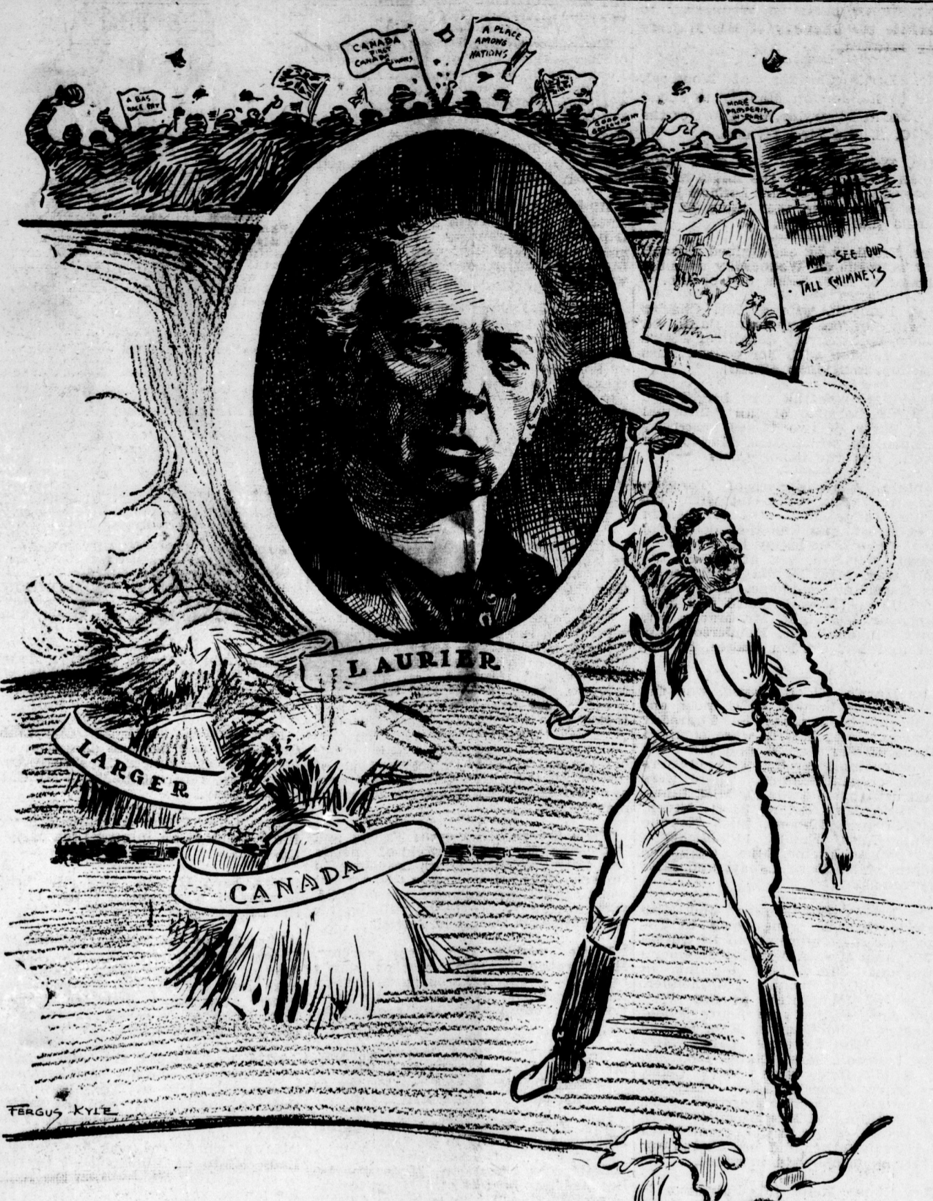
Will the Rest of the World Kindly Excuse Mr. John Canuck If He Appears to Jubilate Unduly—But Thursday Was a Great Day for Him and He Doesn't Care Who Knows It.