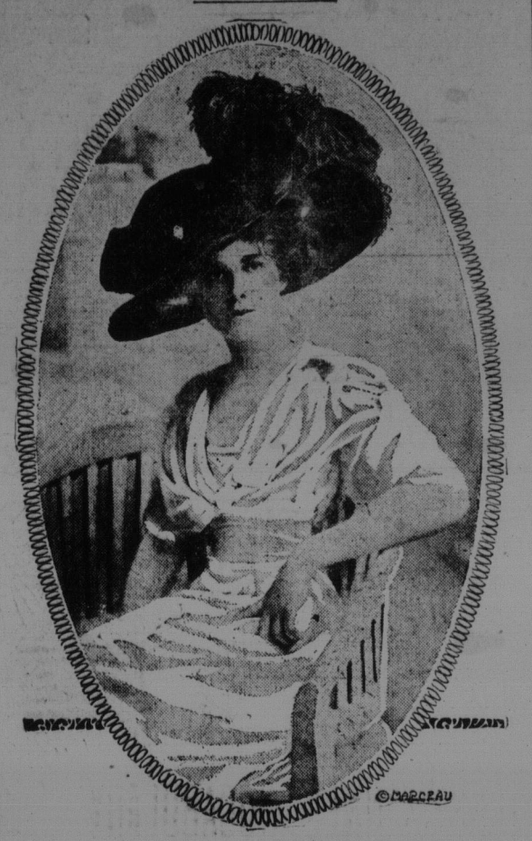
AN ASTROLOGICAL OPINION