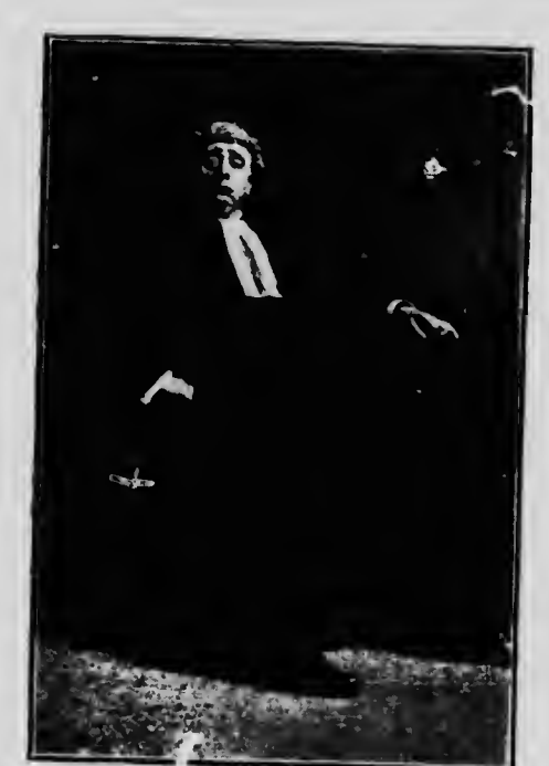
MR. SERJT. SNUBBIN

Buzfuz: Were you called a "wretch" by one of the lady