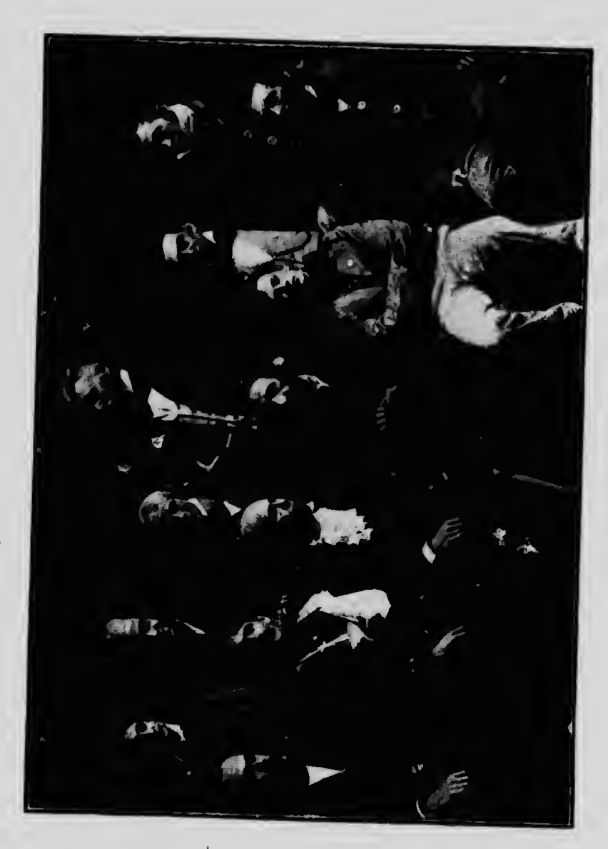
THE GENTLEMEN OF THE JURY