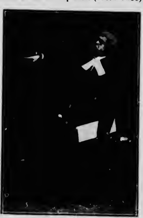
MR. SERJT. BUZFUZ

"Bill Stumps, 'is Mark "---would hestiate before believing him capable of duplicity and deception, but appearances cannot be relied on. I will leave it to my learned iriend to outline the facts of the case and fittingly characterize the conduct of this defendant, as he alone of all the members of the British bar is competent to do, contenting myself with the more humble duty of merely opening the case, and giving you, in these few words, the general information which it is necessary vou should have.