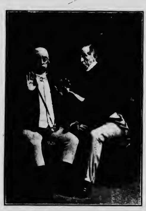
MR. PICKWICK AND MR. PERKER

caught theinnocent boy to her maternal bosom, and put the bill up in her parlor window. Did it remain there long? No. The serpent was on the watch; the mine was preparing, the sapper and miner was at work. fore the bill had been in the window three days three days, gentlemen, a Being, erect upon two legs, and bearing all the outward semblance of a man, and not of a monster, knocked at the door of Mrs. Bardell's house. He enquired within: he took the lodg-