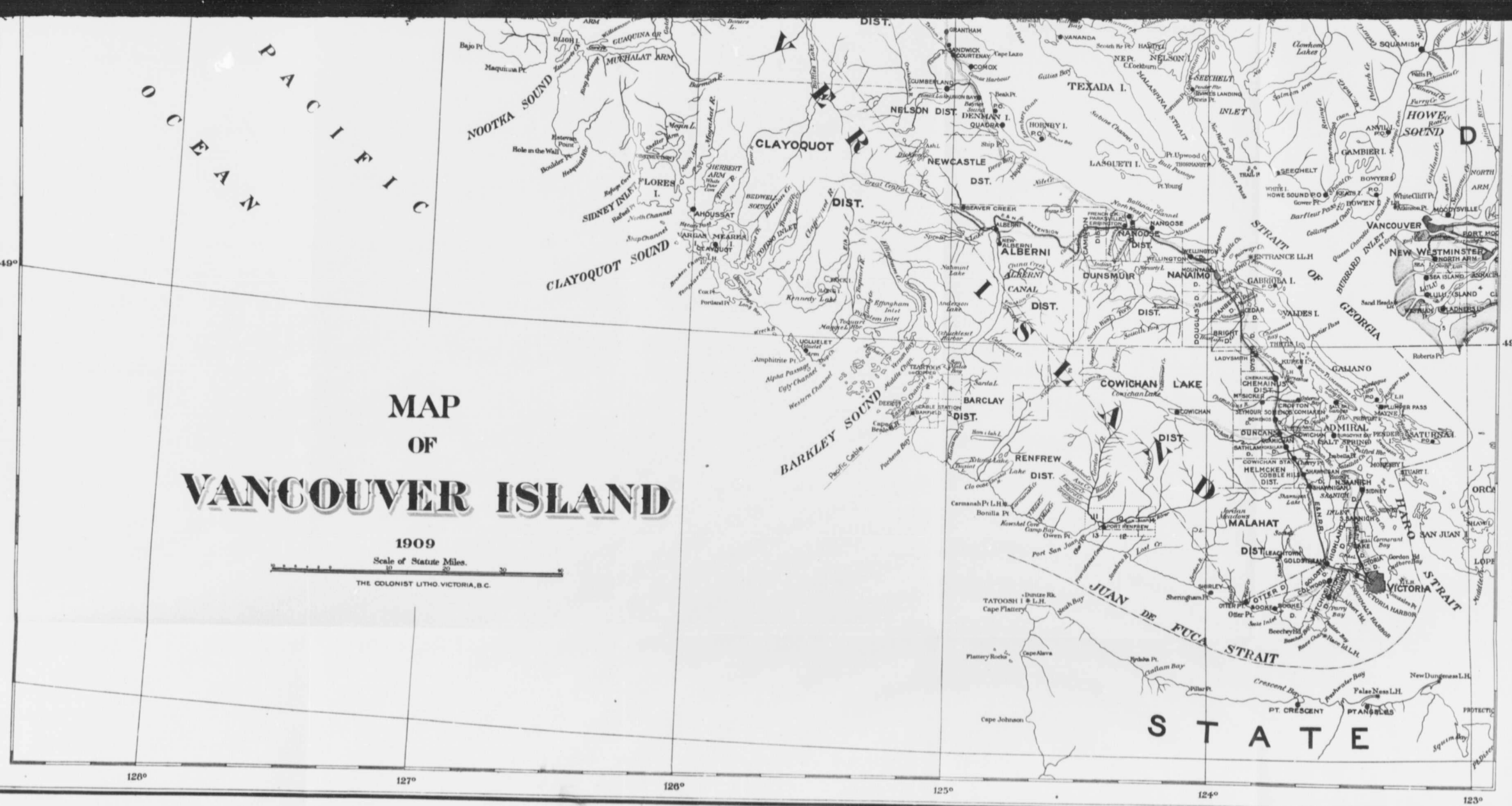
MAP OF VANCOUVER ISLAND

1909 Scale of Statute Miles. THE COLONIST LITHO VICTORIA, B.C.