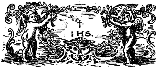
ILLUSTRATION TO VOL. LXVI