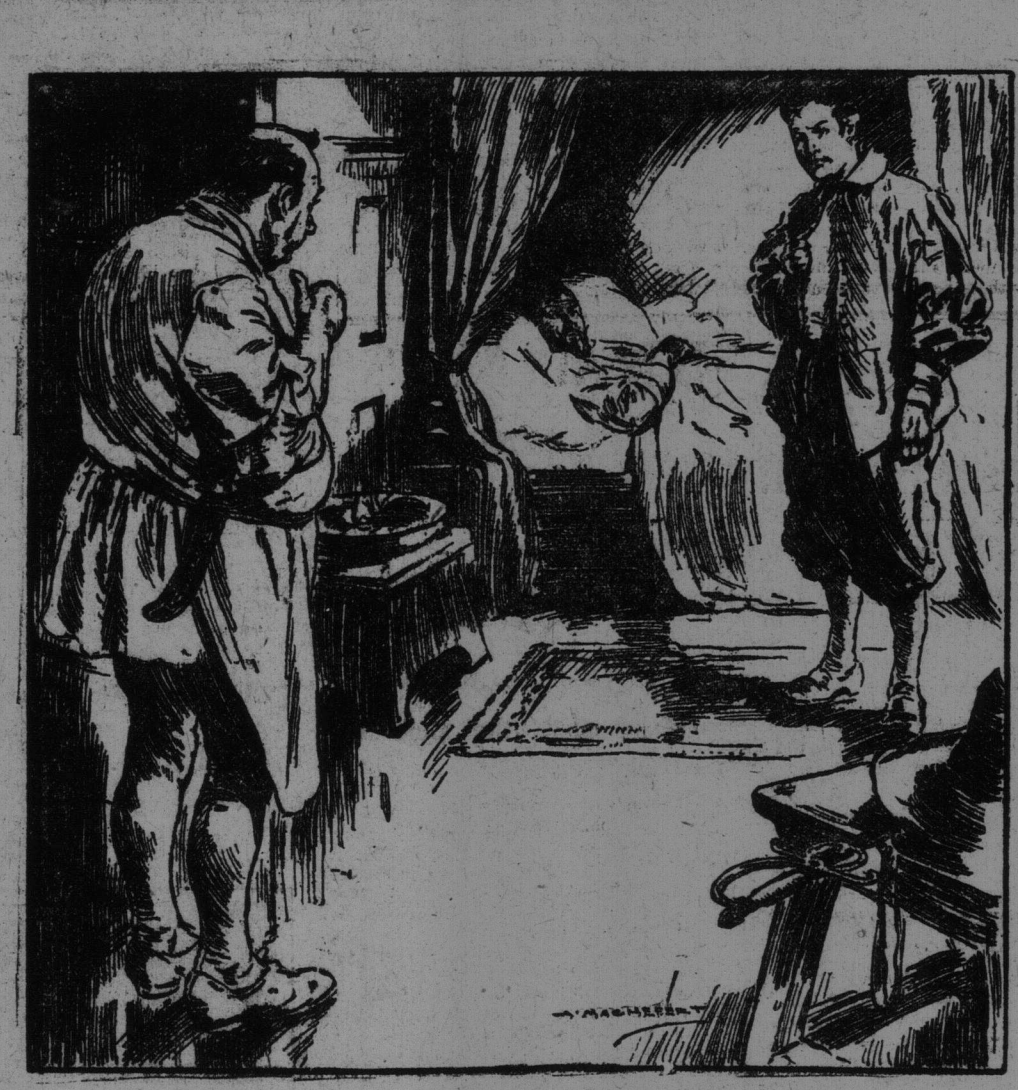
"I dared not deny him further!"

Don't fail to absorb the opening installment of this famous story, commencing Saturday, May 5th.