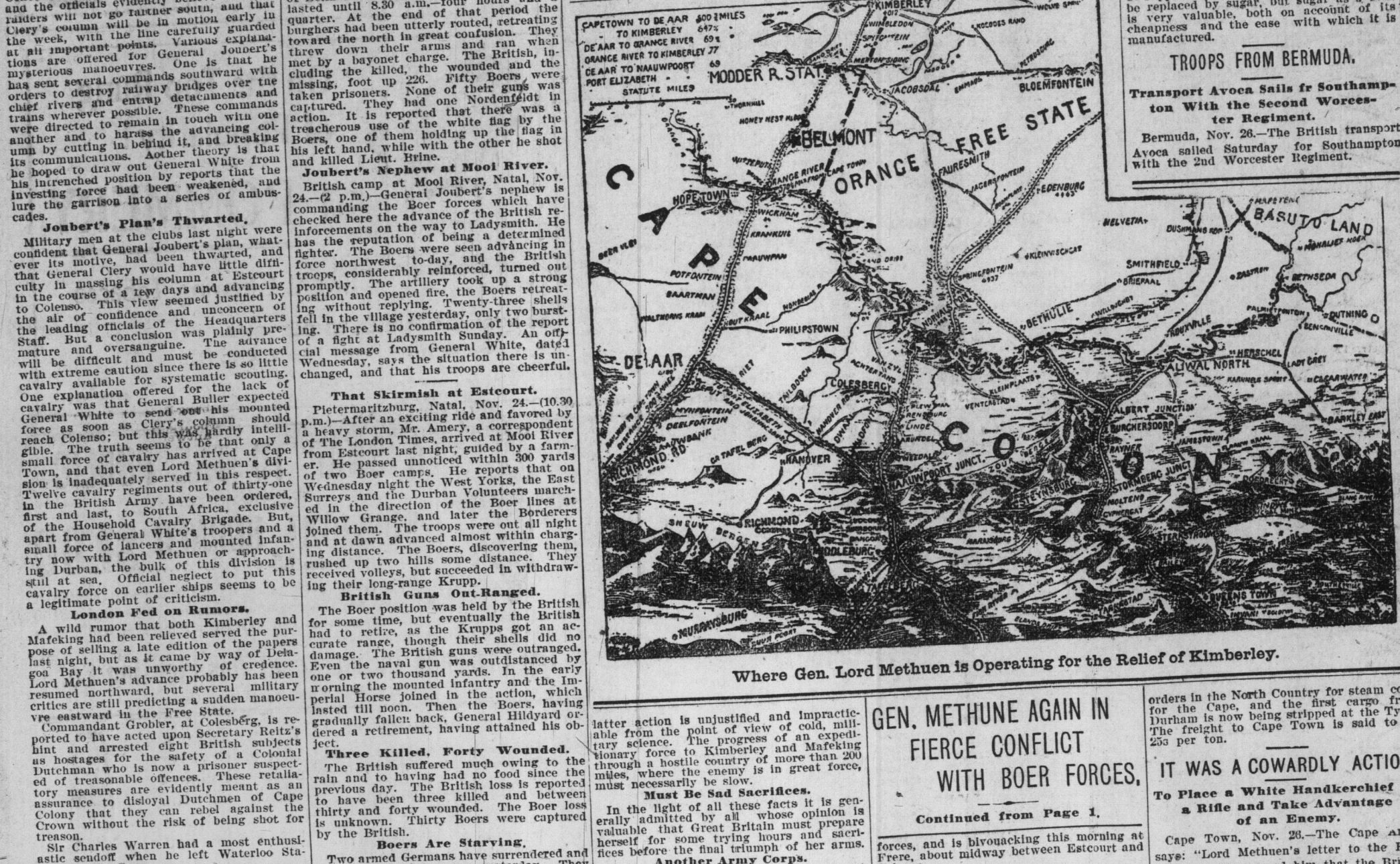
Where Gen. Lord Methuen is Operating for the Relief of Kimberley.